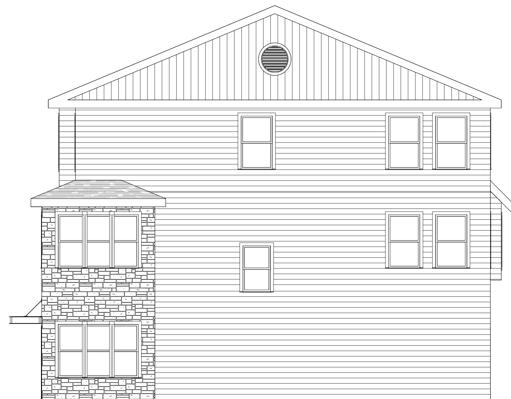
④ LEFT SIDE ELEVATION 3/16" = 1'-0"