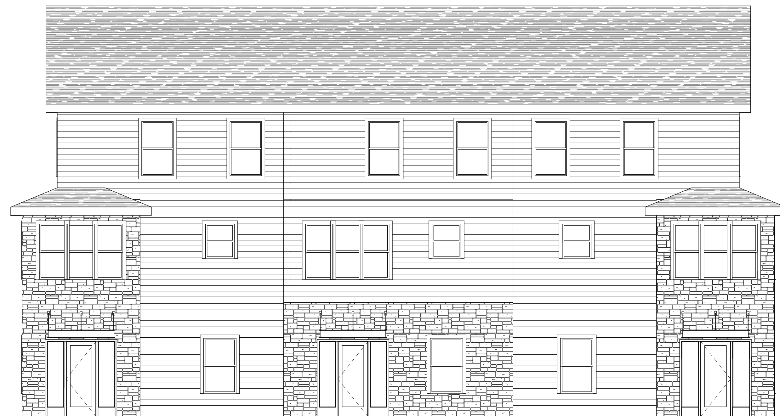
③ COURT YARD ELEVATION 3/16" = 1'-0"