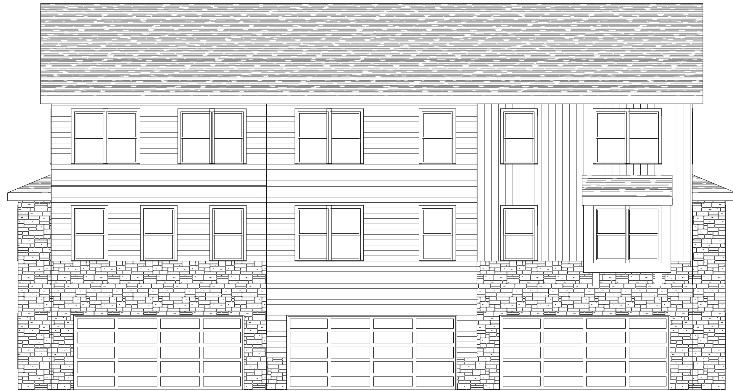
① STREET SIDE ELEVATION 3/16" = 1'-0"