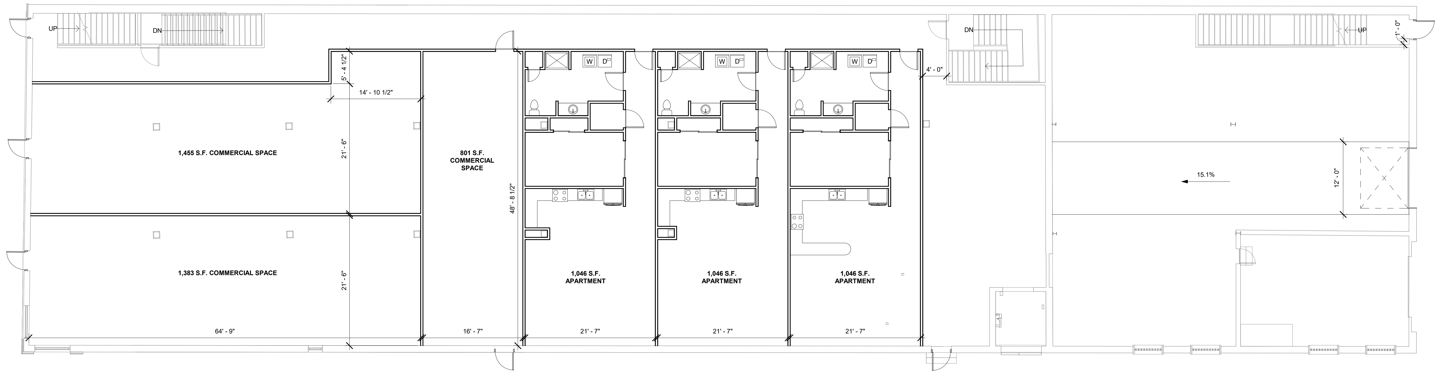
1 PROPOSED FIRST FLOOR 1/8" = 1'-0"