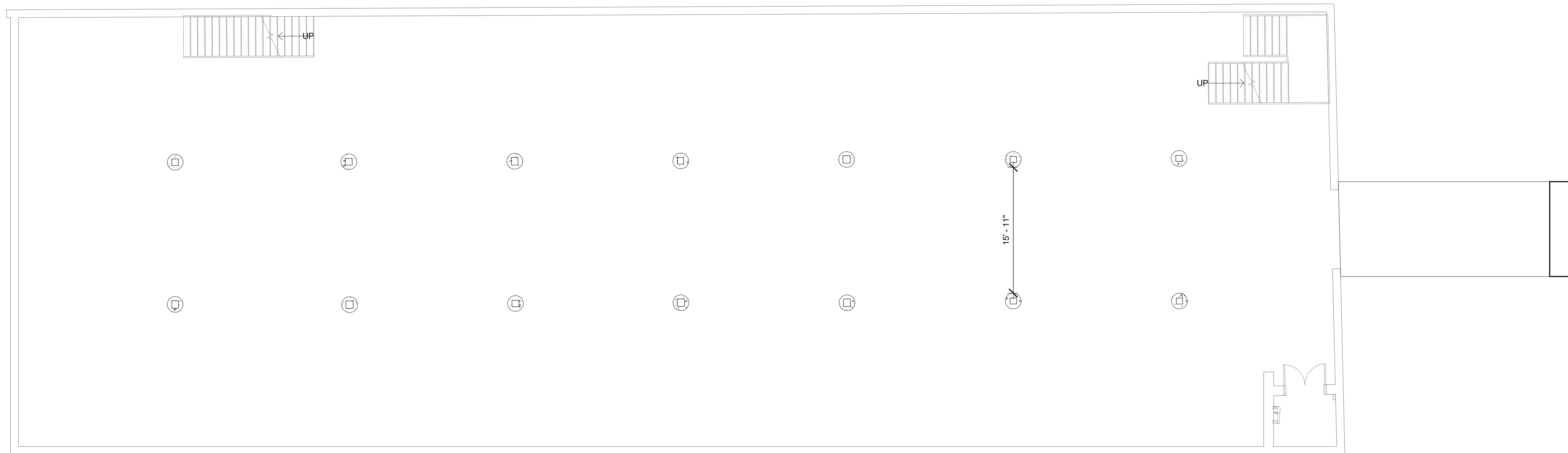
① PROPOSED BASEMENT 1/8" = 1'-0"